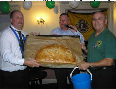
Lions Club Harvest Auction

an enjoyable afternoon with Children's Games, a Tea Tent, Barbie, Bar, and Bouncy Castle and thank everyone that came along. Now autumn has arrived, we will have another "Harvest Auction" on