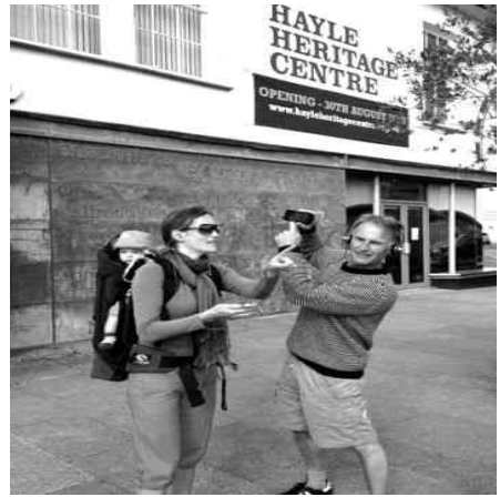
Local band Sandy Acre 7 test the free Hayle Churks mobile phone app.)

interesting stories about Hayle, or artefacts please bring them along to the centre – they would love to see them and they are looking for volunteers to help run the centre so if you have a love of history and your town get in contact, you can give as little or as much time as you want. The centre will be open Tuesday, Wednesday and Thursday 10 -3 and they are also hoping to open on a Saturday 10-3 but please contact them first. Opening times can information can be found on the website at: hayleheritagecentre.org.uk or by calling on :01736 757683